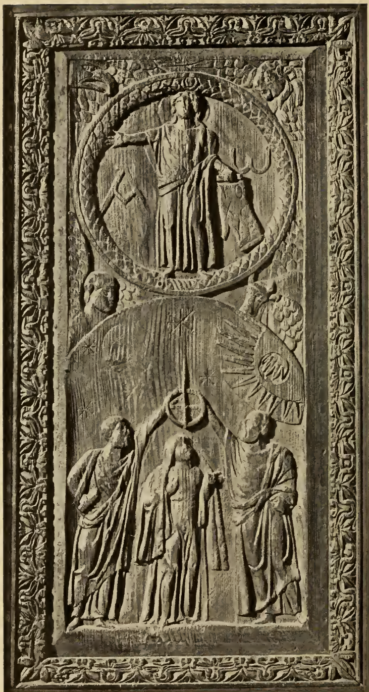
A PANEL FROM THE WOODEN DOORS OF S. SABINA, ROME. FIFTH CENTURY.